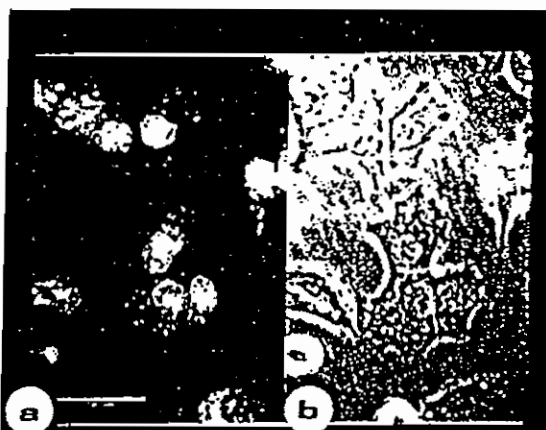
Fig. 3 Detection of Ukrain in melanoma cells. Cells were treated with 100 µg/ml Ukrain for 30 min. Autofluorescence of the drug was excited by 488 nm laser light.